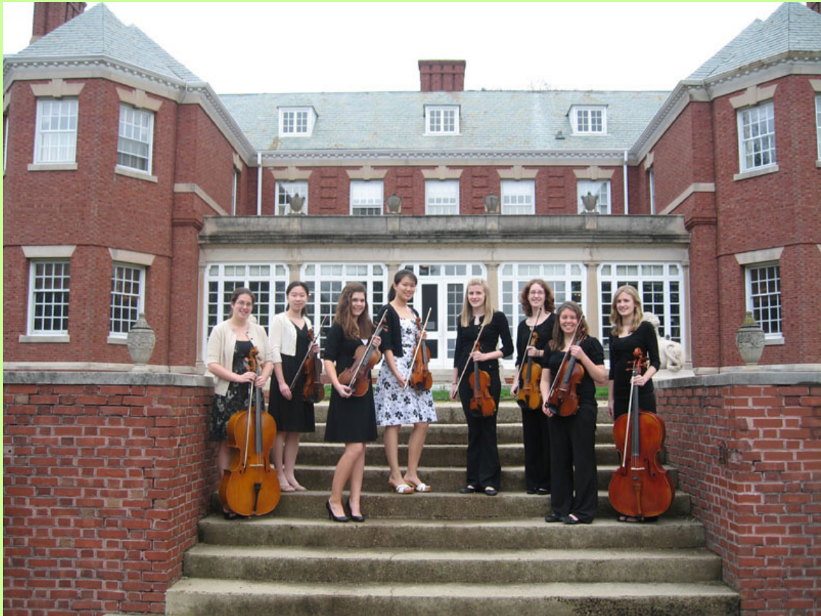
Chamber Orchestra members gather on the steps of the stately Allerton House during a visit in April.